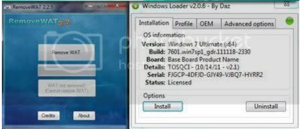
Windows 7Loader Slic Activation with OEM Information